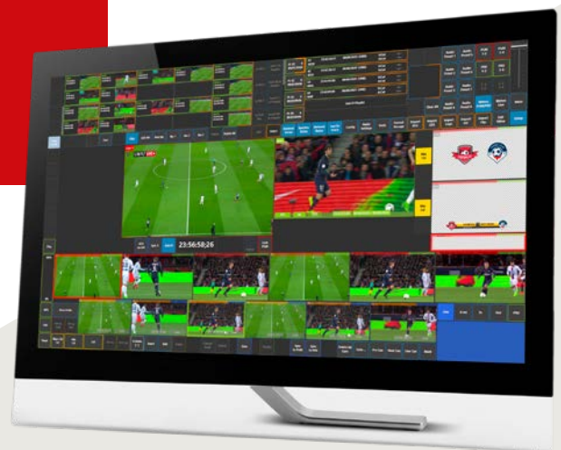
ViBox8 - Mini Touch UI